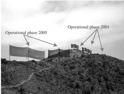
Figure 4: Large Fog Collectors, constructed between 2001 and 2005, on Falda Verde Mountain .

group is that it mixes diverse ages and interests. The idea of the people is that the project continues growing in the number of LFCs and in cultivated land, thus being able to generate economic benefit for the families.