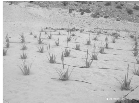
Figure 3: Aloe Vera plantation with his respective fog water irrigation system.

Once the evaluation of potential was done and even without high collection rates at the site, the fishermen's dreams were realized. When the comparisons between Falda Verde and Alto Patache (Iquique) were done, the data were an average of four times less for Falda Verde (1,46 l/m 2 /day in Falda Verde and 7,12 l/m 2 /day en Alto Patache). Nevertheless, due to the extreme water need identified in the study area and the enormous enthusiasm and work effort shown by the fishermen's group, the construction project was realized. In 2000, the group found finances to build six Large Fog Collectors on the top of Falda Verde Mountain. Three structures, one triple, one double and one single were constructed. The construction took 55 days and included one system of greenhouses (6 rows of 26 x 1.10 meters long) and an irrigation system.