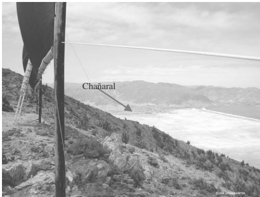
Photograph 1: Chañaral's bay viewed from the top of Falda Verde Mountain, near the fog collectors.

h) Accessibility: The Mountain has a small footpath up which it is possible to climb. It takes approximately 2 hours to slowly walk to the collectors.